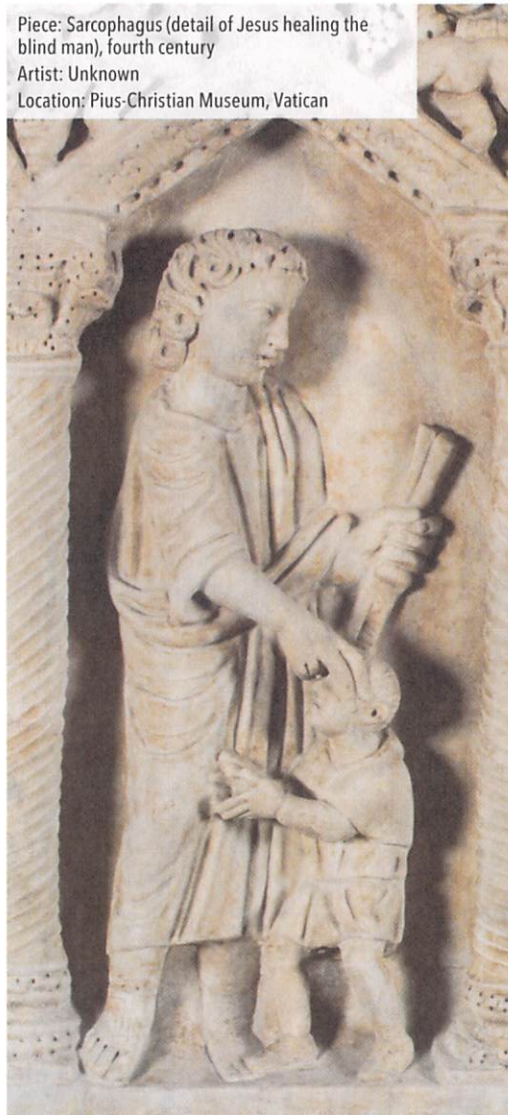
Piece: Sarcophagus (detail of Jesus healing the blind man), fourth century Artist: Unknown Location: Pius-Christian Museum, Vatican

For Reflection Do I have a heart for the poor as Jesus did? How can I express that real preference in practical ways?