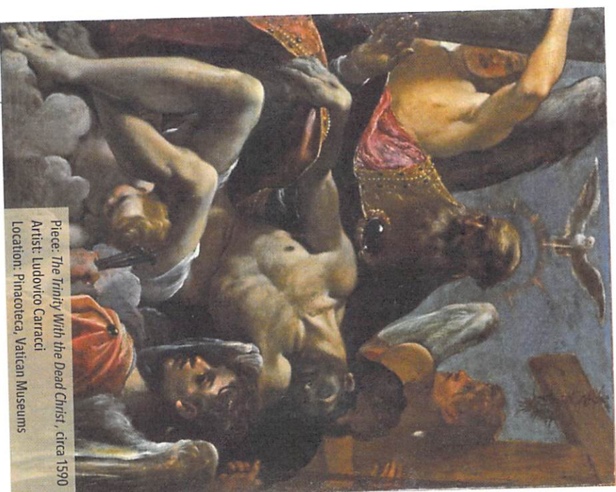
Piece: The Trinity With the Dead Christ , circa 1590 Artist: Ludovico Carracci Location: Pinacoteca, Vatican Museums

Faith teaches us that God willed his only begotten Son to suffer and die to save humanity. This divine decision manifests justice and mercy. It shows not only that God actually required satisfaction for our sins but also that no one but a God-man could offer a suitable sacrifice. Because he was God, Christ could offer an