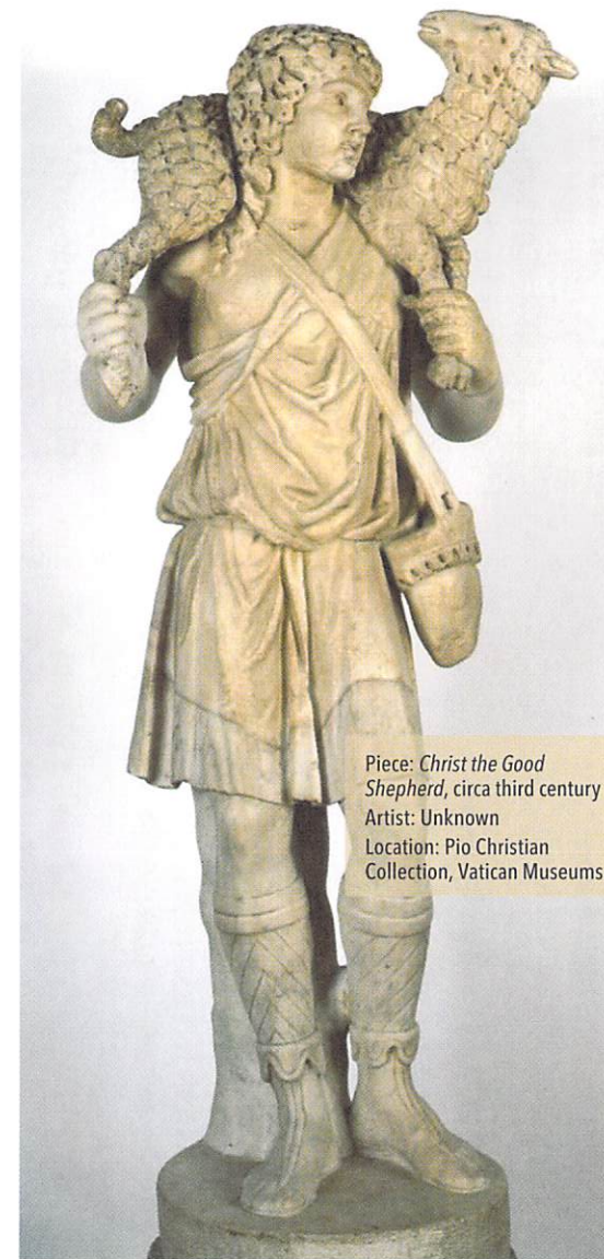
Piece: Christ the Good Shepherd , circa third century Artist: Unknown Location: Pio Christian Collection, Vatican Museums

How often do I listen to the Good Shepherd over the other messages around me? How do I stay informed of what the pope and other shepherds of the Church are saying?